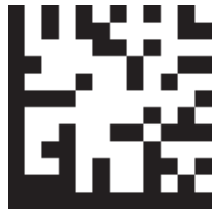
(50) Disconnect previous connection