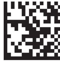
Finished HID Bluetooth settings