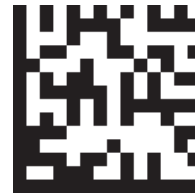
Baud rate 4800