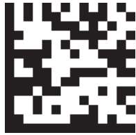
Setting Bluetooth module as visible