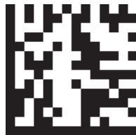
Baud rate 2400